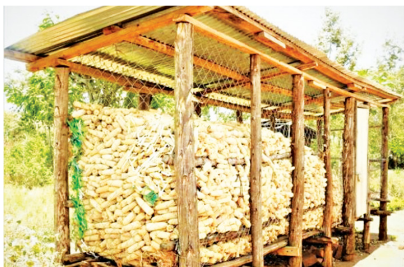
Post harvest handling

commodity value chain from production, processing, transportation, brokerage and marketing through working closely with the private sector actors and cooperations. JESE will actively seek to attract private sector participation in value addition activities and investments; improve access to sustainable financial services for small-scale farmers through supporting rural financing schemes and markets; expanding the network of market infrastructure including appropriate structures to reduce post-harvest losses; strengthening cooperatives in order to build a capacity of farmers in management, entrepreneurship and group dynamics.