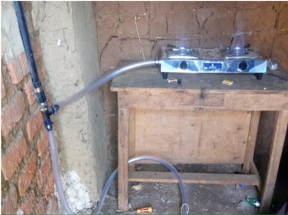
Biogas system is very efficient at cooking