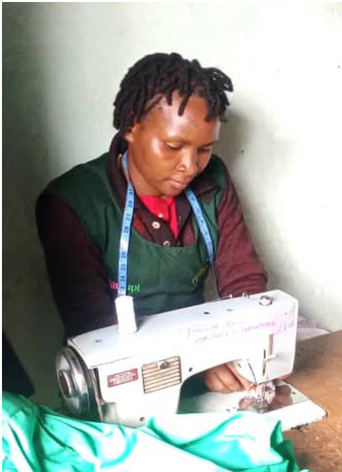
A skill Up! trainee in tailoring during her assessment.