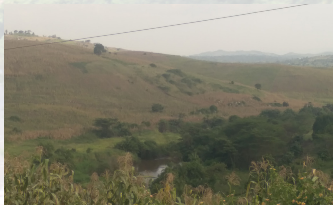
A photo taken in July 2023 showing farming activities around River Mpanga at the boarder of Ibanda and Kitagwenda districts. This was a major concern for most of the listeners.

In response, JESE committed to engage all the key stakeholders to ensure that the issue is resolved and the degraded buffer zone restored and protected against any further degradation.