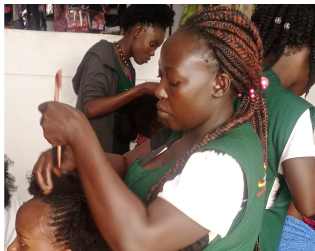
A youth trained in hairdressing doing her DIT assessment.

During the course of training, JESE in partnership with WHH, supports the youth with training materials and equipment and also offer a lunch contribution to ensure that the trainees do not drop out due to financial constraints.