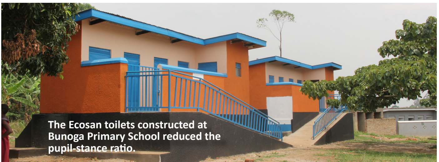
The Ecosan toilets constructed at Bunoga Primary School reduced the pupil-stance ratio.

This intervention is one of the many that JESE in partnership with Join For Water is implementing in the Mpanga Midstream as strategy to microcatchment protection under the protection and Conservation of Water Resources programme.